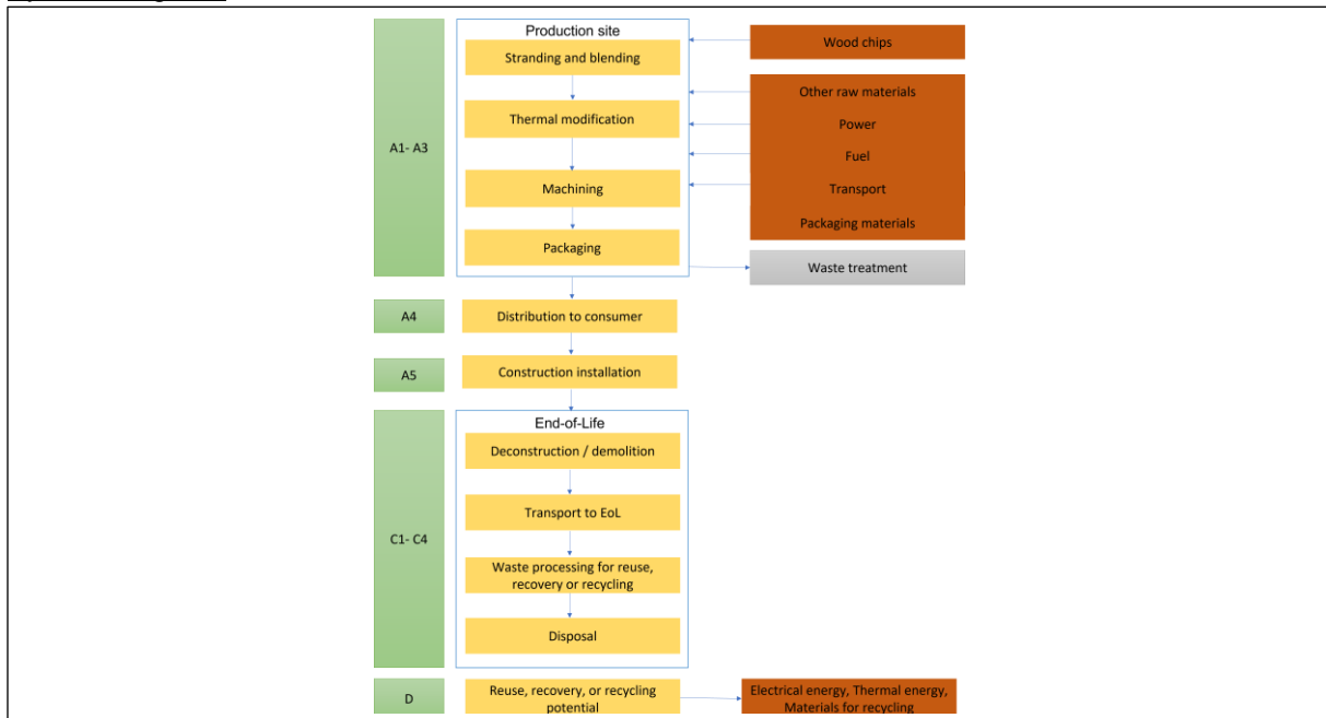
Figure 2: Process flow diagram showing the production and distribution of West Fraser MDF